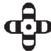
Screen Print Mask